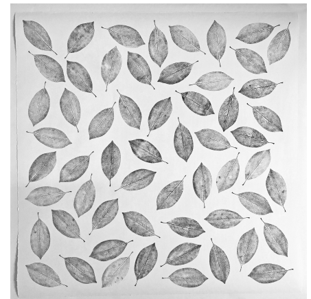
Andre Mirzaian, Magnolia Leaves , 2017, ink on archival paper, 50" x 50" (127 x 127 cm)

Natural Patterns is a selection of original prints by Andre Mirzaian, showcasing unique organic patterns that can be found in nature, particularly in the ring patterns of a tree's trunk or the intricate details of its leaves. Mirzaian takes cross sections of raw wood or lumber and lays out leaves collected from nature to create direct ink transfer prints onto paper. As if through the eyes of a botanist, the viewer can curiously examine the sinuous patterns in the wood grains of different tree species, and the similarities in the shapes and veins of leaves that determine the type of tree they grew from.